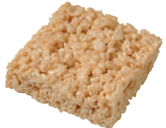
1.17-oz. Original Flavor Bars

First introduced to the market more than 20 years ago, our original JJ's Marshmallow Crispy's is now joined by two new flavors, chocolate chip and chocolate rainbow sparkles.