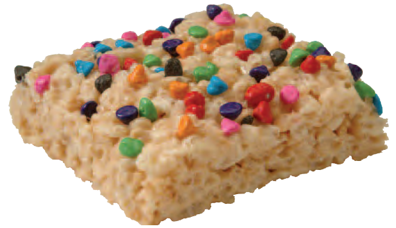
1.17-oz. Chocolate Rainbow Sparkles Bars