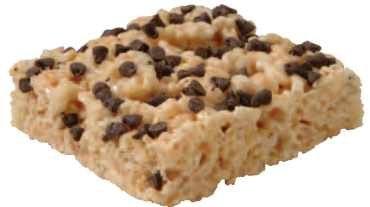
1.17-oz. Chocolate Chip Bars